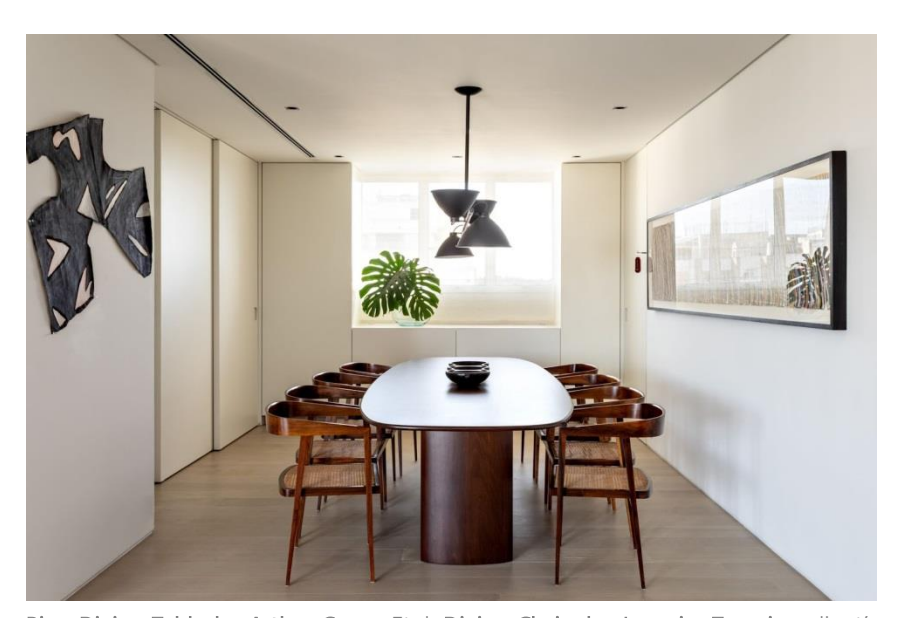
Rino Dining Table by Arthur Casas, Etel; Dining Chairs by Joaquim Tenreiro, client's collection;