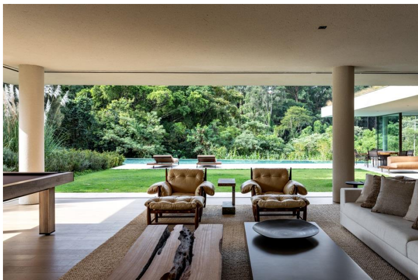
Poltrona Mole com Banqueta por Sérgio Rodrigues, Herança Cultural; Mesa de Centro de Tora, Tora Brasil; Mesa de Centro Aiso, Micasa; Sofá Lounge, Micasa.