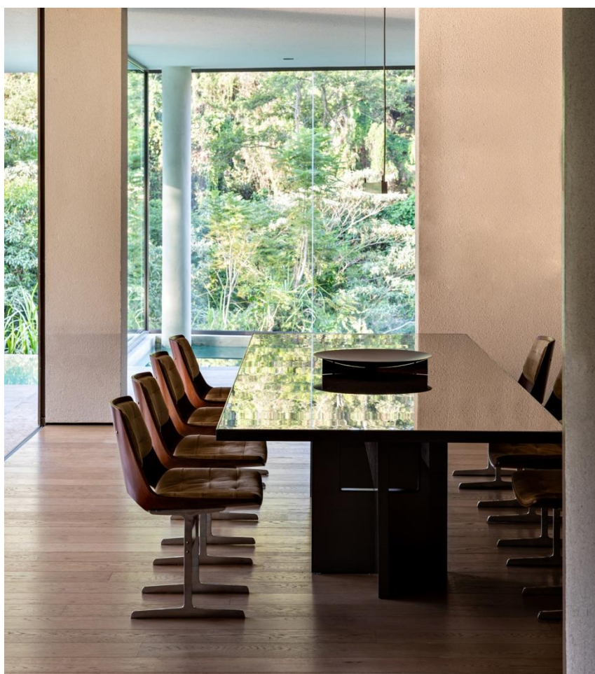
Mesa de Jantar Esquadro, Glass11; Cadeira Marina em Freijó por Jorge Zalsupin, Herança Cultural.