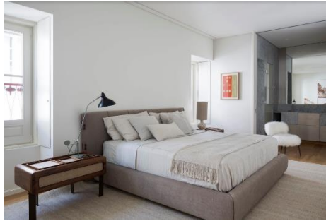
Cuff Open bed , Bonaldo, QuartoSala; Nepal armchair (White Mongolia) , Baxter, QuartoSala; Tupi side table , Arthur Casas Design, Etel; Mantis BS3 Table Lamp , DCW; Pol Chambost table lamp , bought in Paris; Untitled (1989) , Guther Forg.