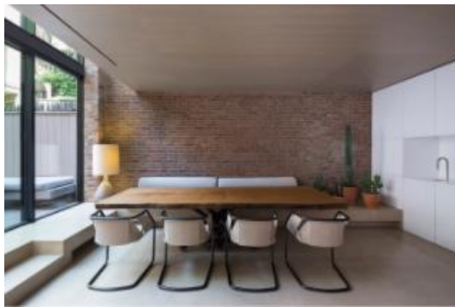
Strip Chair , by Massimo Castagna, Henge; Guaçu Wooden Table , Tora Brasil; Vintage Table Lamp , Casas Edições; TopBrewer Coffee Maker , Scanomat.