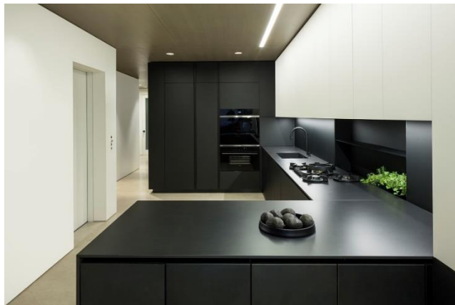
Custom made kitchen, Bазеео by NY Loft.