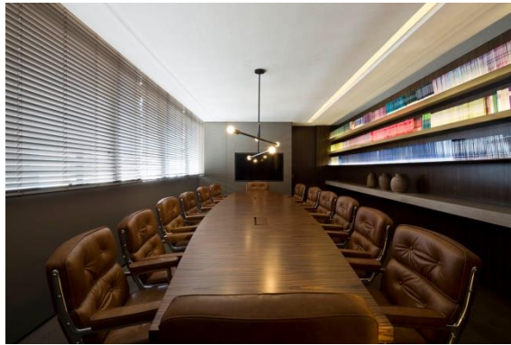
Eames Time Life Executive chair, Herança Cultural; Mini Endless Double Lamp, Roll and Hill, Pau ferro dinner table with concrete base, Jorge Zalszupin, Herança Cultural.